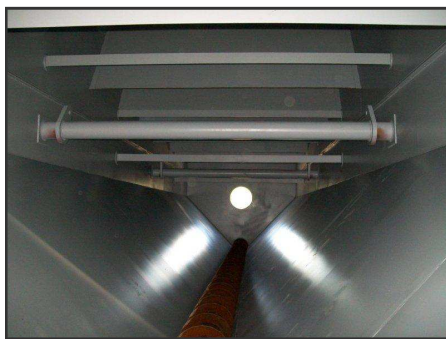
12,000 Gallon Unit