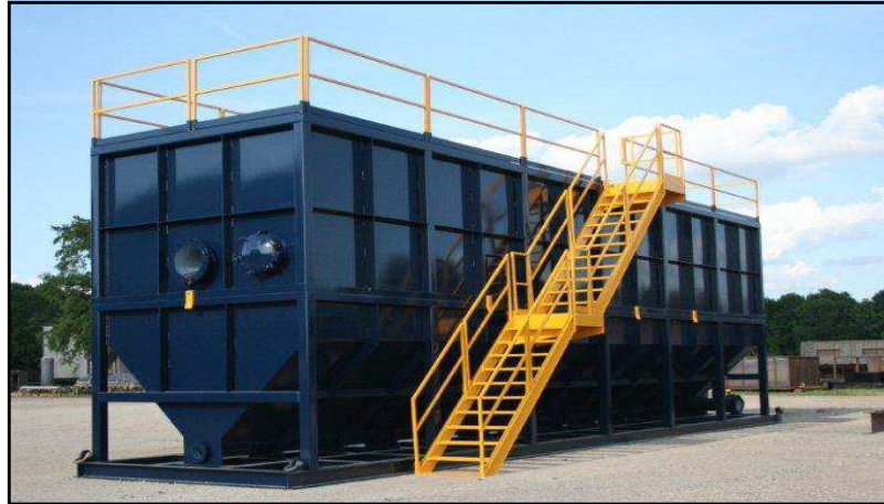
45,000 Gallon Unit